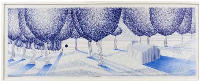
LAIB BITTON Charles, Malcomportement dans la Prairie , 2012 – 152 ; ball pen on paper. ©Charly Gosp. Courtesy: artist and Collection BIC

The BIC Collection will be unveiled to the public and exhibited at the CENTQUATRE-PARIS for 4 weeks, starting Saturday, April 14.